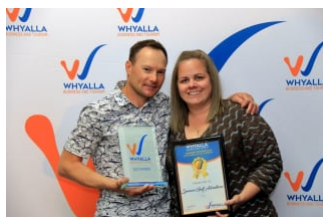
Contribution to Tourism Winner – Spencer Gulf Adventures

You can also express your interest here to keep up to date on key information, nomination dates, support and more - https://shorturl.at/iyYZ6