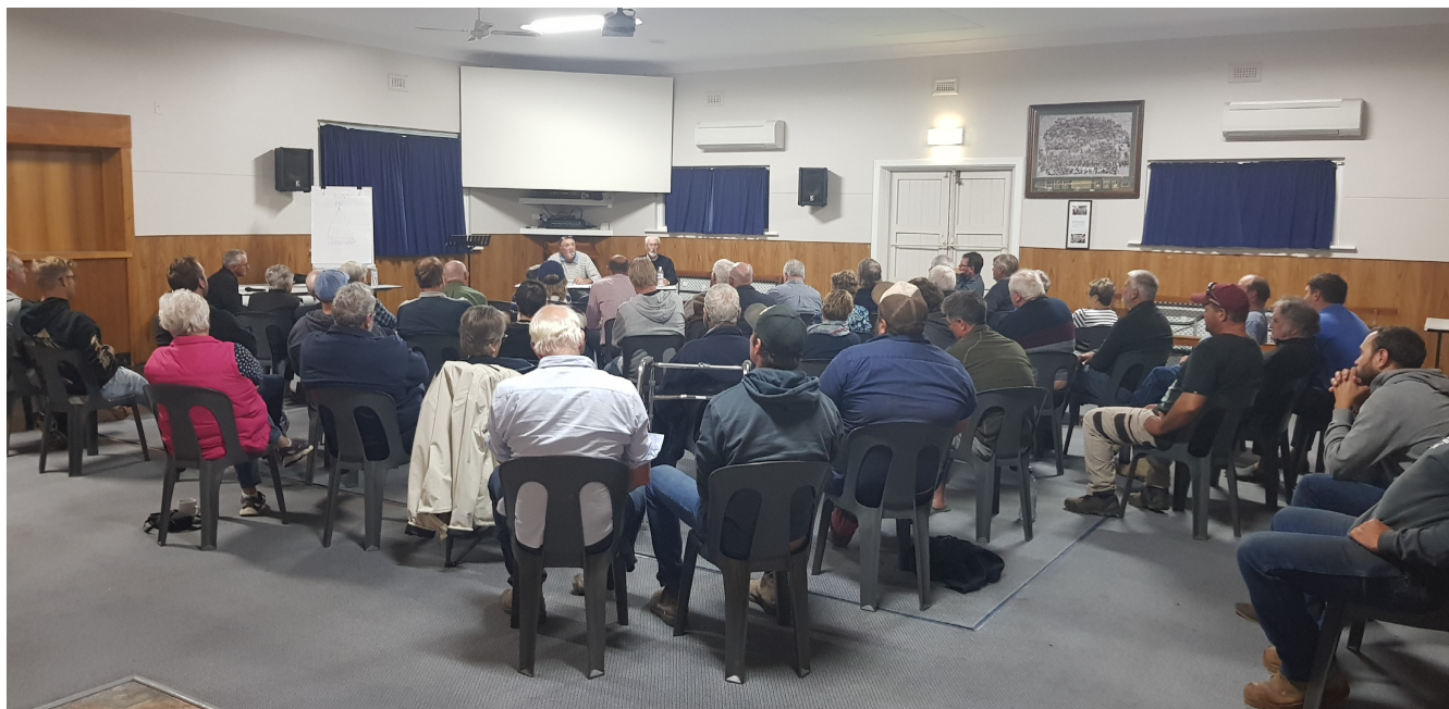
EPCBH grower meeting held at Tumbly Bay on 3 March 2020

Iron Road and EPCBH are currently engaged with preferred investors to fill the balance of an expected $40-50 million equity offering via the establishment of a Cape Hardy Stage I unincorporated joint venture structure (UJV). Formal debt finance appetite is now also being tested given the credible level of grassroots farmer support evidenced at EPCBH's grower meetings and rapid growth demonstrated in paid-up membership.